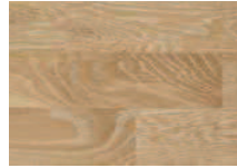
OAK IVORY BR