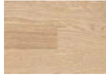
OAK ROBUST WHITE BR