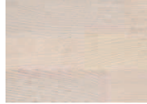
OAK NORDIC WHITE