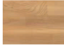
ASH CREAM BR