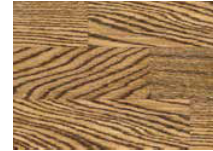
OAK VINTAGE BR