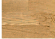
OAK NATURE BR