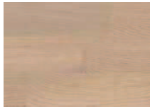
OAK CREAM BR