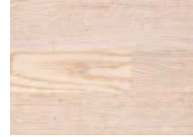
OAK ICEBERG BR