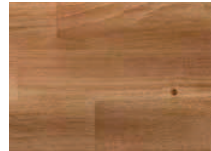
OAK CINNAMON BR