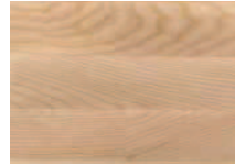
ASH TIRAMISU BR