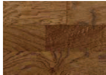
OAK CHOCOLATE BR