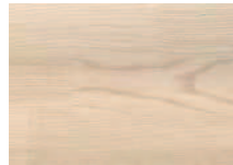
ASH SILKY WHITE BR